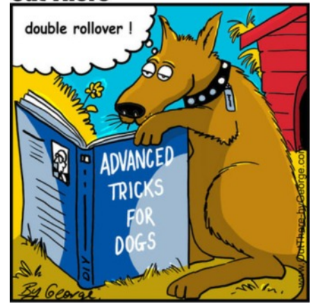
When dogs have ambition